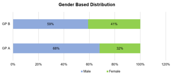
Figure No.1: Shows the gender distribution in the two groups

Table 1: Shows the comparison of Pre and Post-operative mean Keratometry values in Group A and B.