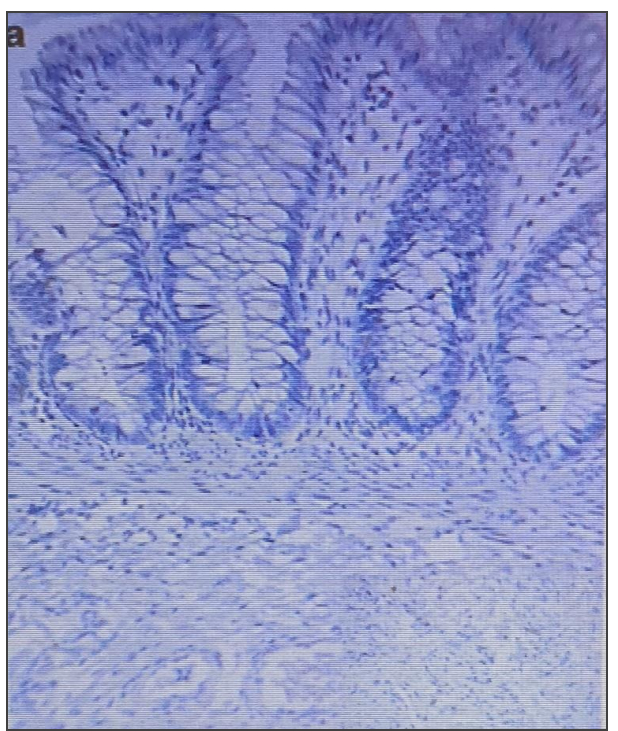
Figure No.1: Calretinin Negative (HD)