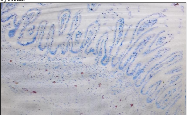
Figure No.3: Calretinin Negative (HD)

there is lack of peristaltic movements in child's intestine resulting in entrapment of stool in intestine. Studies on molecular levels have identified several genes responsible for agangliogenesis of the enteric nervous system.<sup>8,9,10</sup>